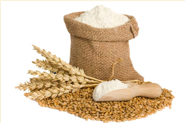
Figure 2: Illustration of wheat products

As a self-funded organization, FIFAMANOR uses all available resources to finance itself. The centre is also involved in several activities that can generate extra-revenue to ensure operations. For example, FIFAMANOR regularly handles calls for proposals from external organizations, in collaboration with national and international collaborators. Training and mentoring practices are also a key tool in developing activities with agricultural partners.