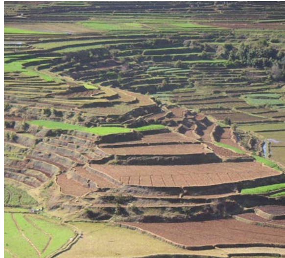
Figure 7: Rice terraces of Antsirabe