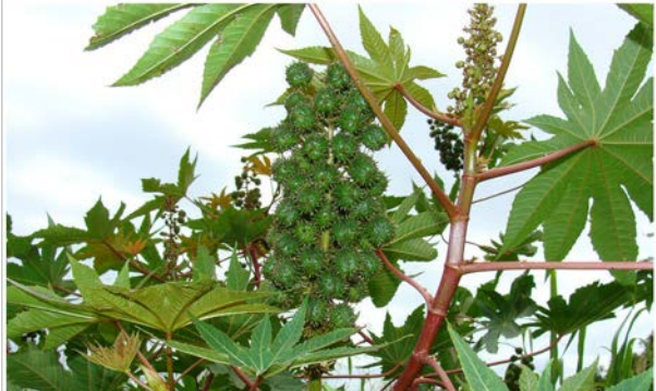
Figure 4 : Castor oil plant ( ricinus communis )

Other products are already becoming new alternatives for Phileol's commercial activities. The company plans to help structure the smallholder farmers it works with in the medium term to allow them to become truly autonomous economic actors and influencers. In addition, Phileol plans to invest in sourcing to new international markets, which would ensure an increased number of farmers and partners. Although the business model is financially sustainable, Phileol is still in the process of adapting its business model, in order to successfully provide private sector-led solutions to poverty.