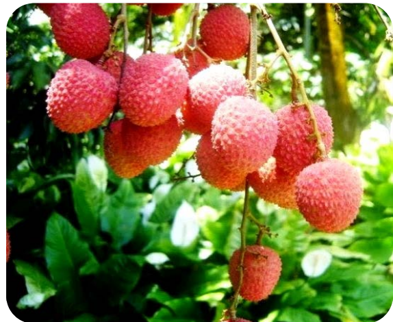
Figure 3 : Lychee tree and fruits

The company is part of a group of 30 exporters who each have a specific supply quota to two permanent clients, the exclusive distributors of Malagasy lychees in Europe. The objective is to ensure a fair and guaranteed price for both producers and buyers.