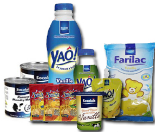
Figure 5: Some of SOCOLAIT product range

For SOCOLAIT, working through area managers ensures a daily supply of fresh milk for its plant, especially during the rainy season when production tends to decrease. At the same time, this approach is more efficient than managing all farms centrally.