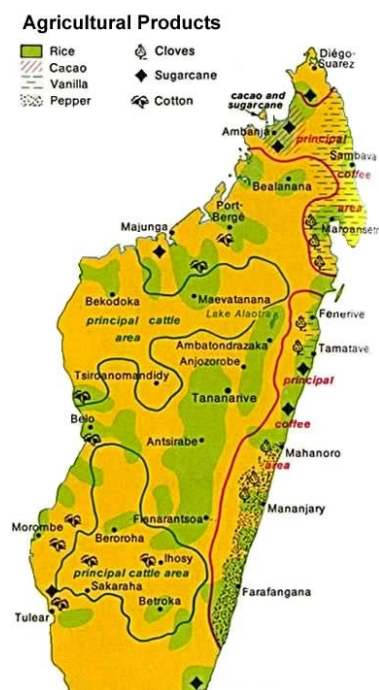
Figure 1 : Map of agricultural products localisation in Madagascar

Despite the agricultural potential of the country, most Malagasy farmers do not have access to a reliable and sustainable market for their products. Some companies, including processors, exporters, and supermarkets are thus creating links between market and smallholder through agribusiness activities. More than 450 agribusiness companies are legally established in Madagascar, including some major processing and exporting companies.