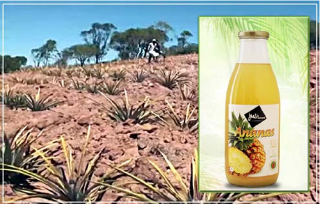
Figure 3 : Pineapple field and a bottle of HavaMad pure juice

The contracts with farmers ensure a guaranteed purchasing price for HavaMad's raw materials, as well as a guaranteed supply. In addition, the contract ensures the quality required by the company, particularly with regards to organic farming practices and traceability. The company supports farmers and cooperatives to achieve these standards, mainly through providing training on the job.